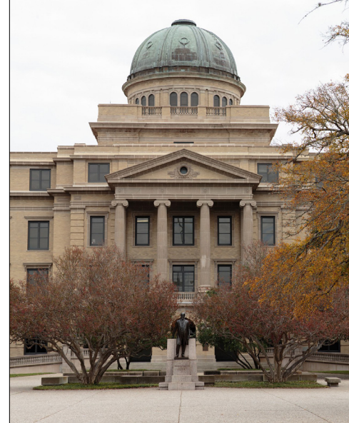
JOEL WORDEN Provost, Goldey-Beacom College

"When students persist through Acadeum, our graduation rates go up, which makes a compelling case for prospective students to come to Goldey-Beacom."